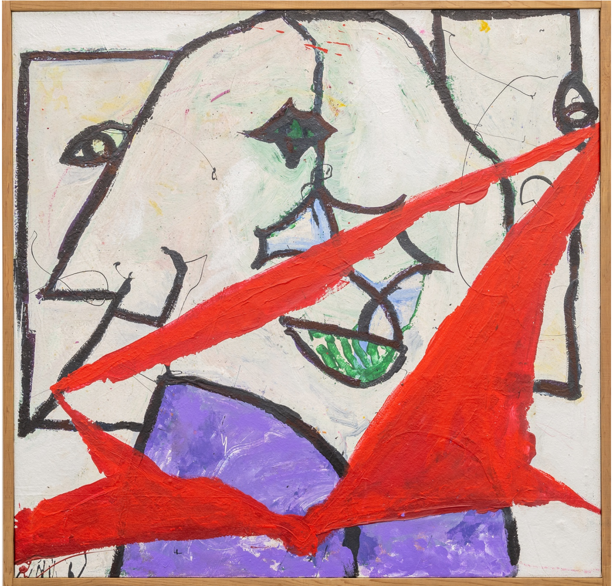
The Clock, 2022 Acrylic and oil on linen 38" x 40", 40.5" x 41.5" framed $16,000