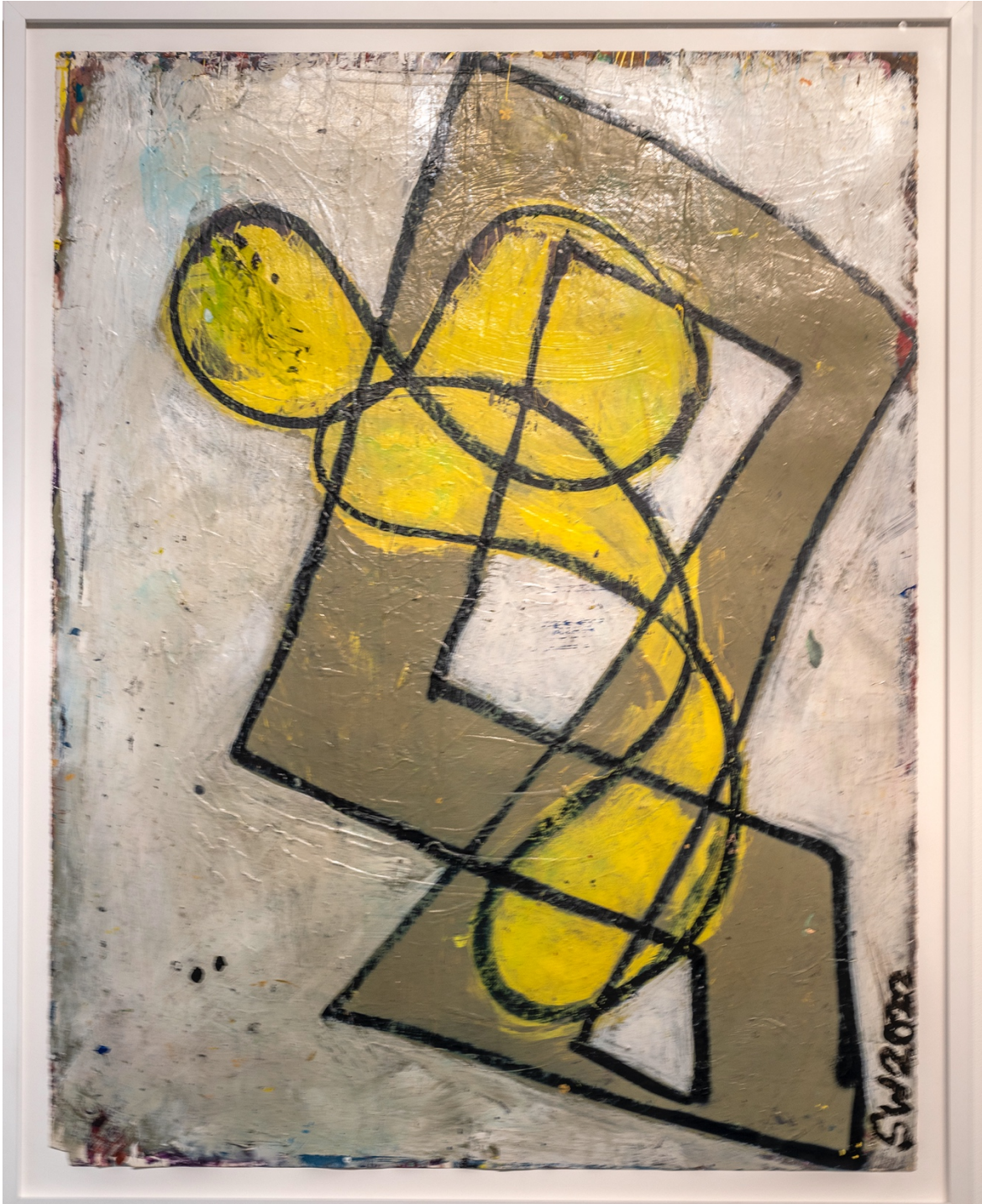
Circadia, 2022 Acrylic and spray paint on paper 48" x 38", 54" x 43" framed $12,000