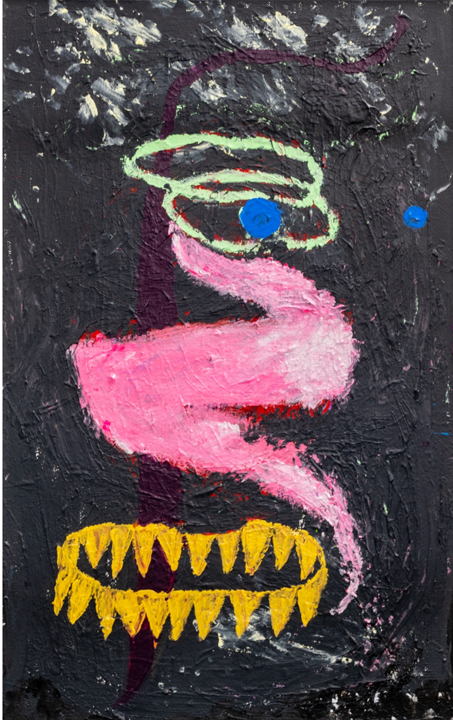
The Mute Swan , 2022 Acrylic and oil stick on linen 48" x 30" $14,000