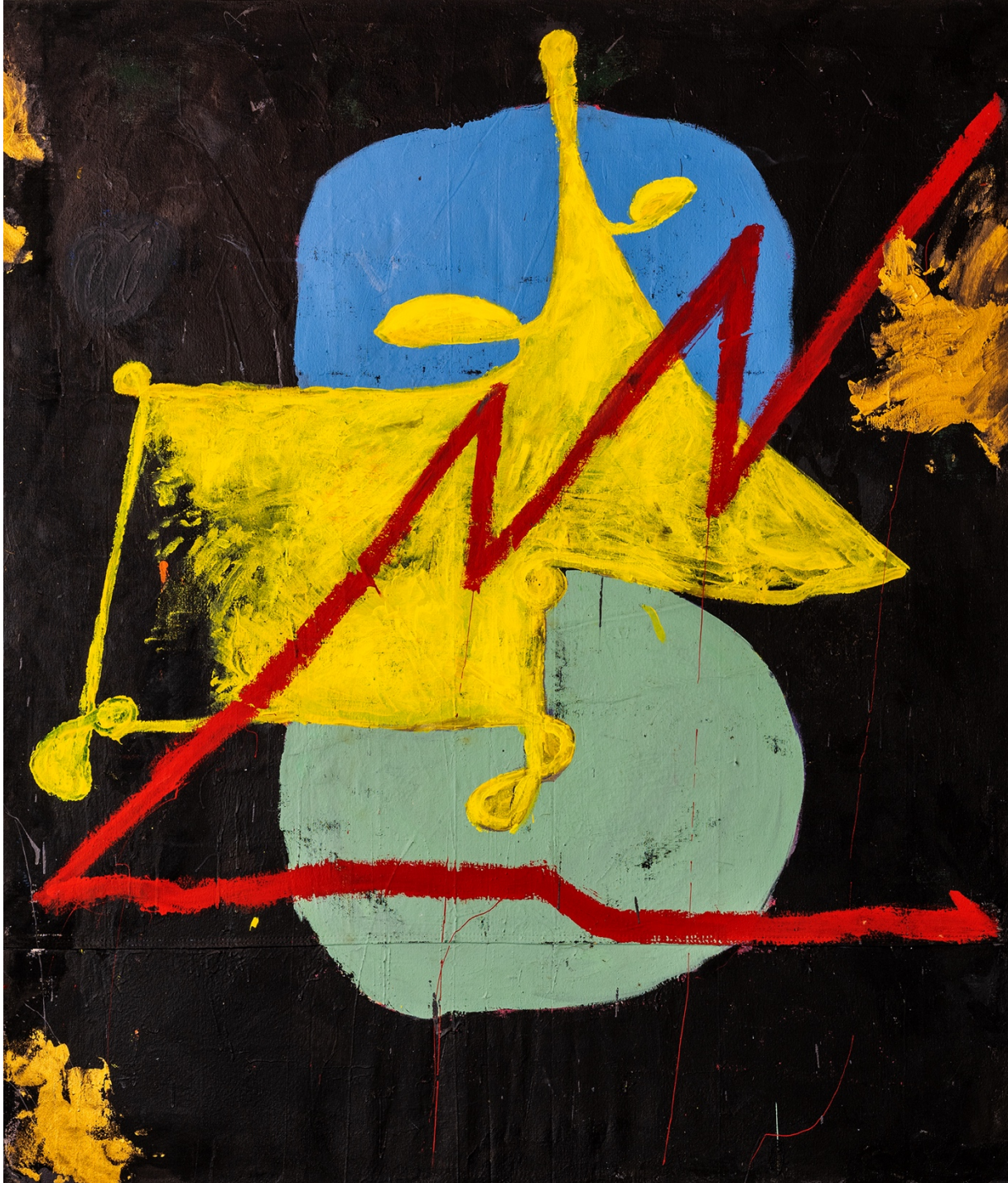
Star Gazer , 2022 Acrylic and oil stick on linen 69" x 59" $18,000