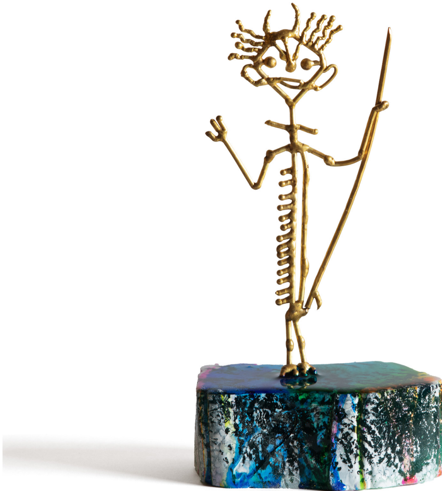
PAN, 2022, 7.5 X 4 X 2.5 INCHES, BRASS, RESIN $1,000