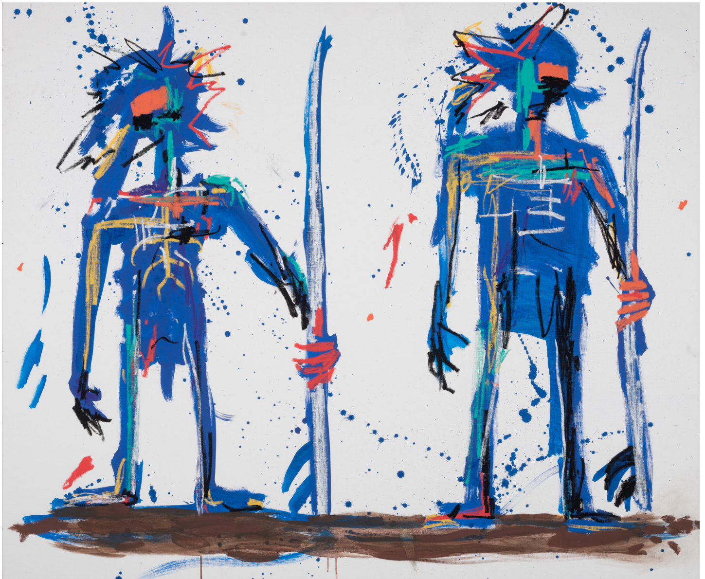
ULTRA, 2022, 60 X 72 INCHES, ACRYLIC GUACHE ON LINEN STRETCHED ON PANEL $22,000