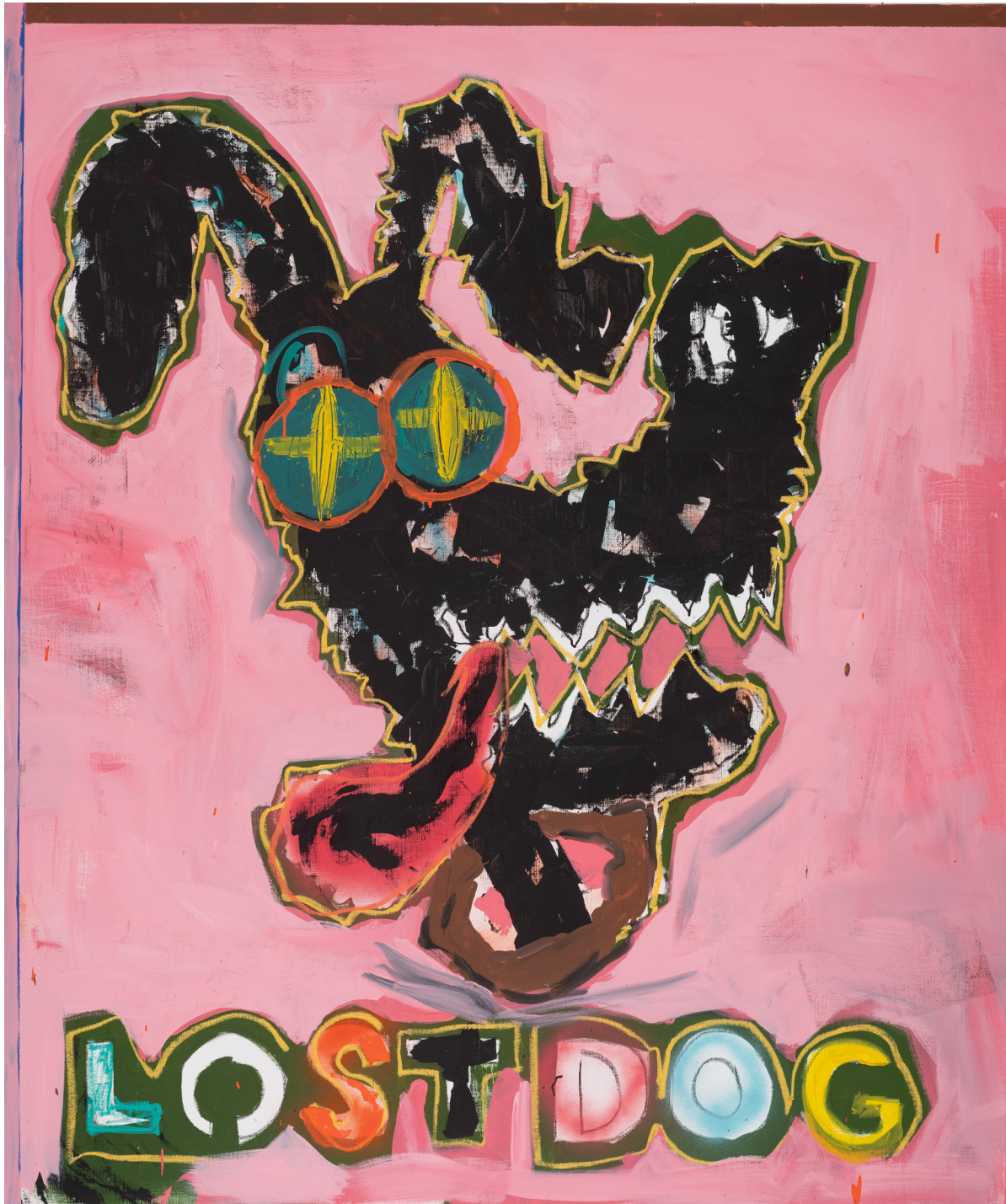
LOST DOG, 72 X 60 INCHES, ACRYLIC GUACHE ON LINEN STRETCHED ON PANEL $22,000