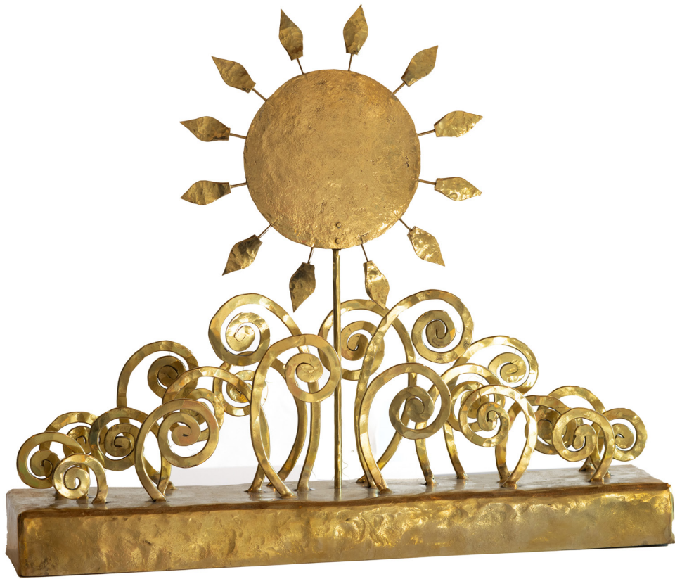
BRAND NEW DAY, 2021, 18 X 21.5 X 4.5 INCHES, BRASS $16,000