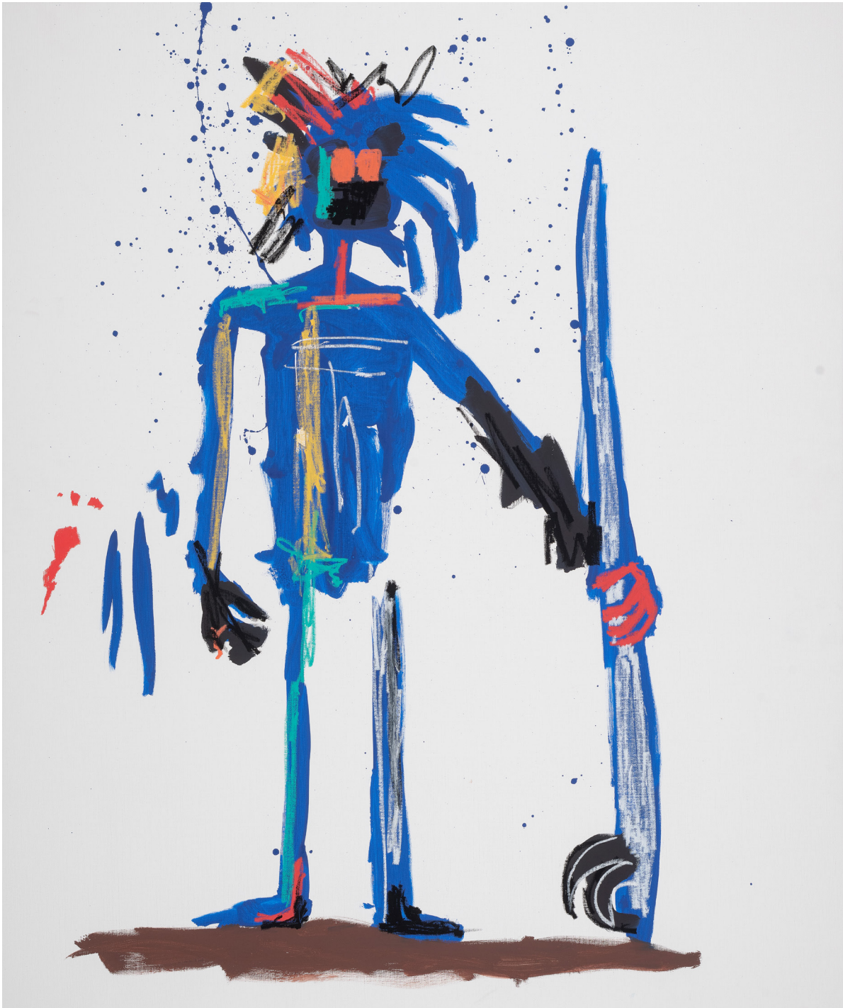
MARINE, 2022, 72 X 60 INCHES, GUACHE ACRYLIC ON LINEN STRETCHED ON PANEL $22,000