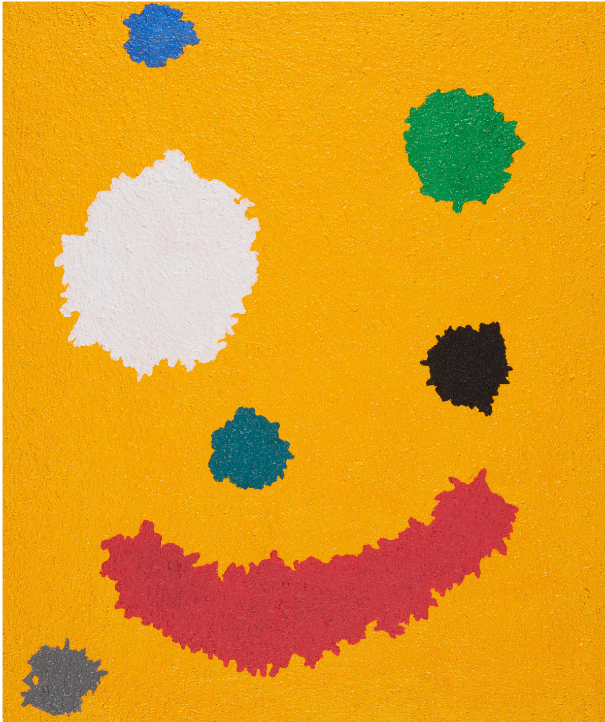
STEAL YOUR FACE, 2022, 48 X 40 INCHES, ACRYLIC GUACHE, SAWDUST ON PANEL $10,000