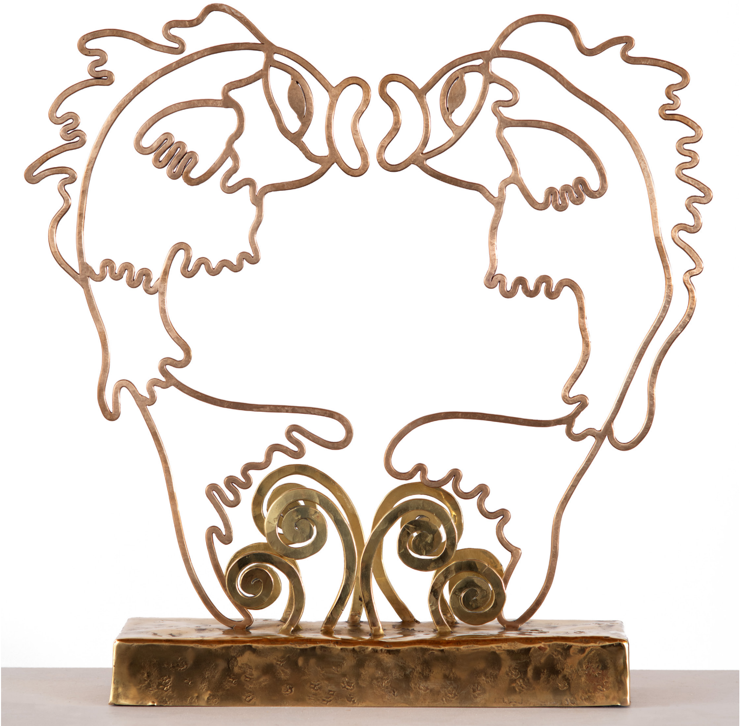
KISSING FISH , 2022, 19.5 X 4.5 X 19 INCHES, COPPER, BRASS $16,000