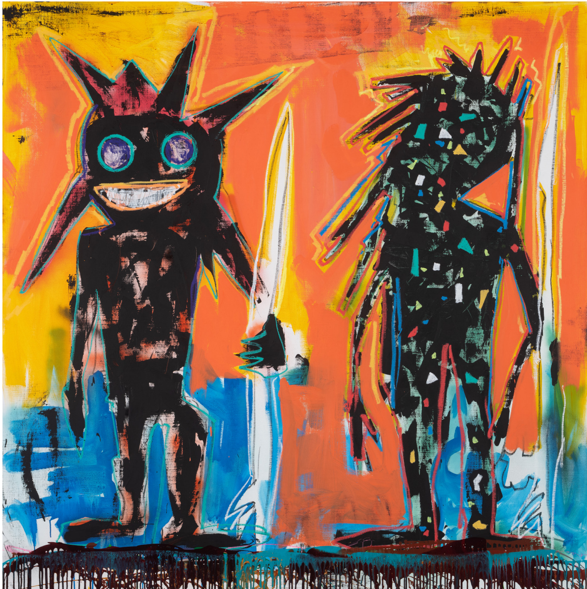
RIP DOG, 2022, 65 X 65 INCHES, ACRYLIC GUACHE, SPRAYPAINT ON STRETCHED LINEN MOUNTED ON PANEL $20,000