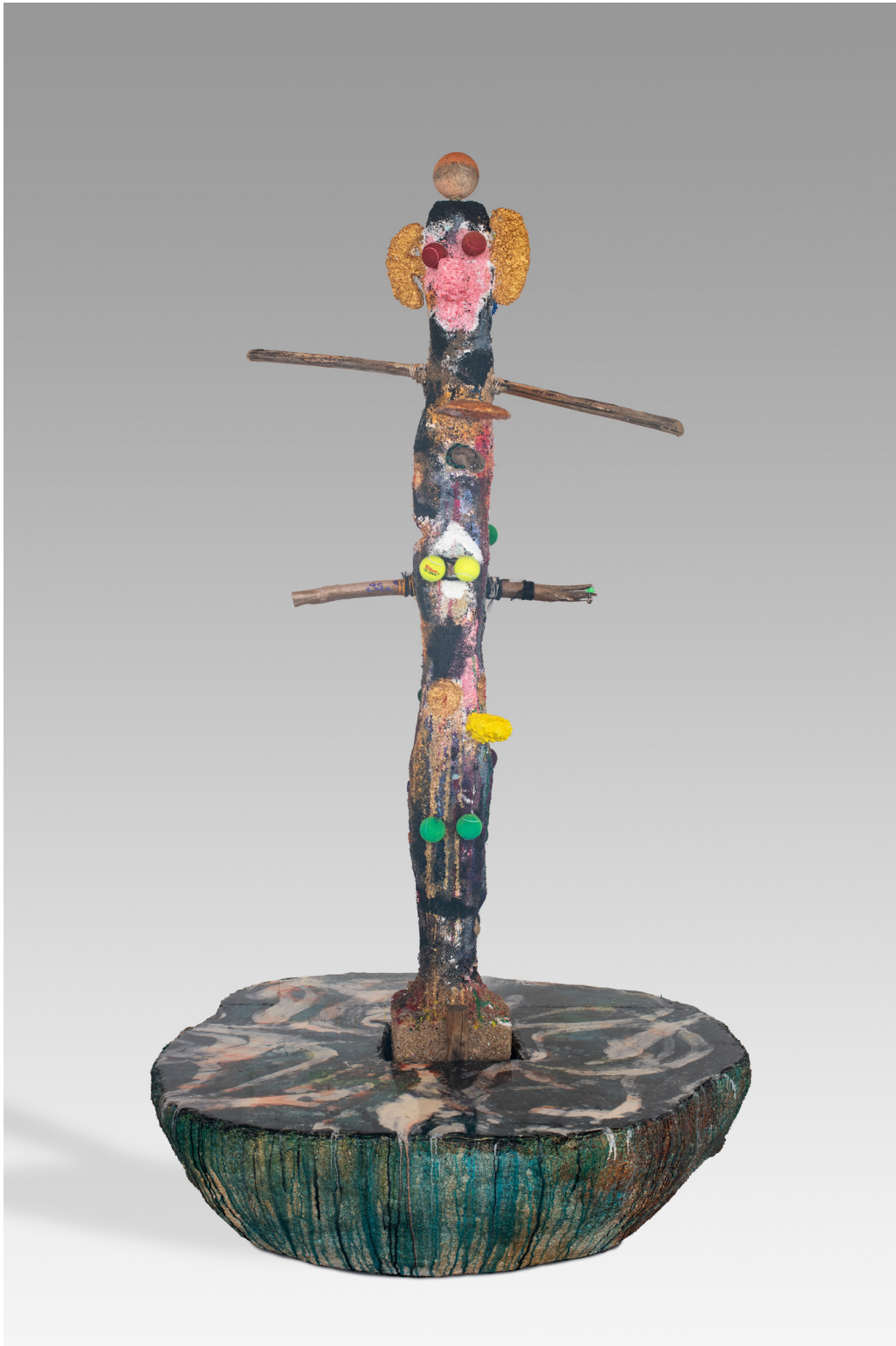
ADRIFT , 2022, 111 X 65 X 65 INCHES, BLUE FOAM, POLYURETHANE, SAW DUST, ACRYLIC, RESIN $26,000