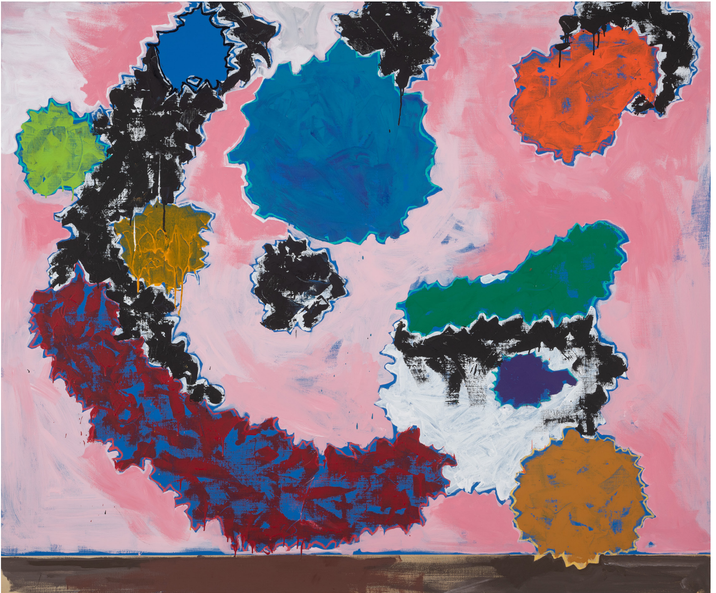
WORM HOLE, 2022, 60 X 72 INCHES, GUACHE ACRYLIC ON LINEN STRETCHED ON PANEL $22,000