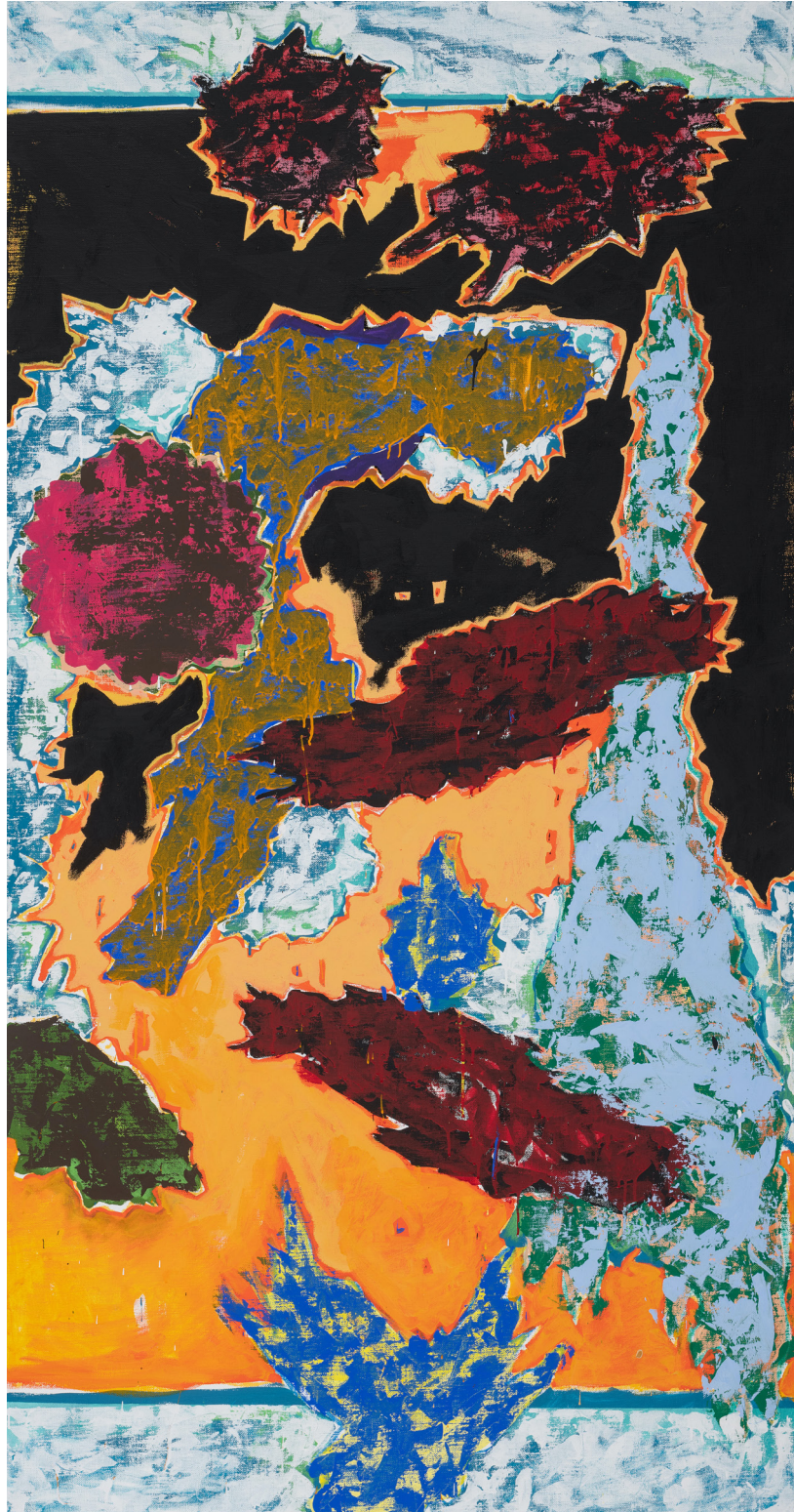
BAY TO OCEAN, 2022, 84 X 44 INCHES, GUACHE ACRYLIC ON LINEN STRETCHED OVER PANEL $18,000