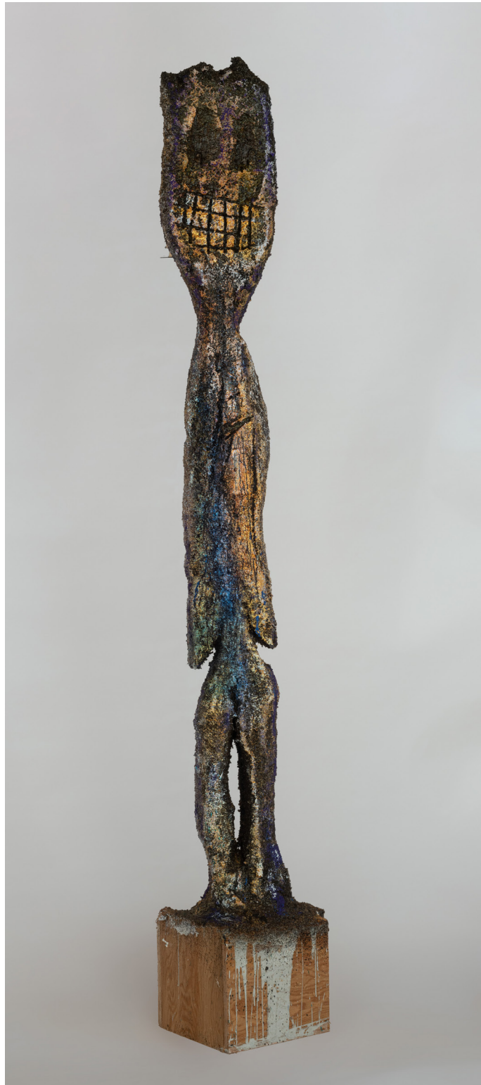
LARRY, 2021, 105.5 X 13.5 X 13.5 INCHES, PLYWOOD, POLYURETHANE, SAWDUST, ACRYLIC $18,000