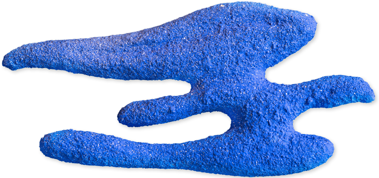
BLUE BIRD , 16 X 33 X 2 INCHES, BLUE FOAM, SAWDUST, POLYURETHANE, GAUCHE ACRYLIC $3,600